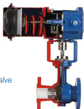
Pressure regulator ZSN (self-operated regulator)