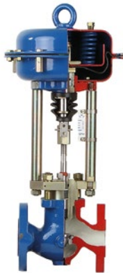
High-performance control valve